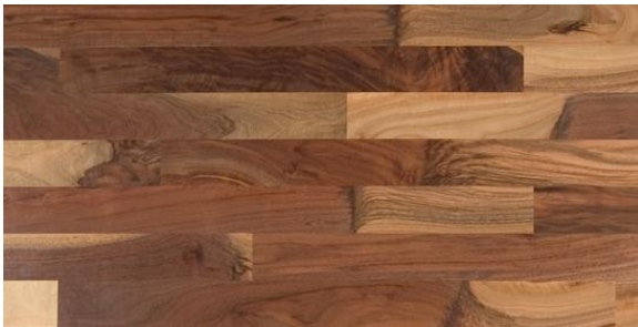
< Orchard Walnut

(We also offer a completely different look in Walnut in our Quartered Select Grade - with the walnut being all uniform colored heartwood in a uniform straight grained look. This is recycled from post industrial waste. Visit our website www.wflooring.com/wfiinc to find out more about this product.)